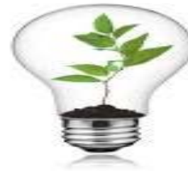
Innovation for Sustainable Growth