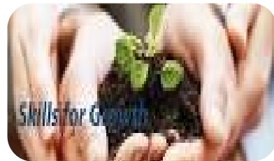
Skills for Growth