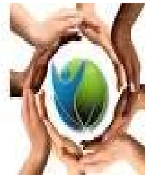
Skills for Inclusion